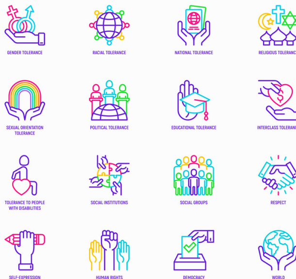
16 THIN LINE ICONS